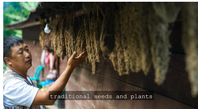
Video 1 – Farmers in Dzongu, Northern Sikkim, discuss the importance of traditional seeds, the challenges they face with the promotion of hybrid seeds and plans to develop a community seed bank, highlighting the ingenuity of farmers, indigenous peoples and communities

Thus, in many cases, the state’s organic policies are transforming spatial systems of production, moving in certain contexts from dense and diverse agroecological polycultures to organic monocultures, reflecting a substantial reorganization of landscapes and nature. Such an approach shares certain similarities